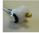
Class "A" voltage sensor