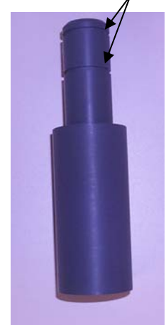
PVC Bottom Cap Adapter PN 090091