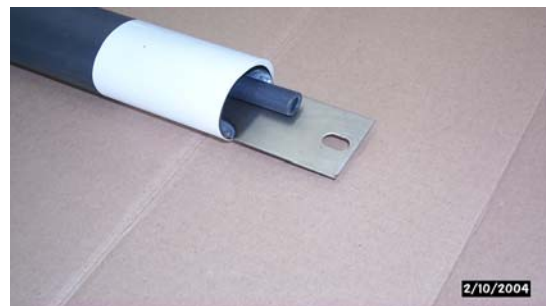
Top of electrode.

UFS Corporation. . .dedicated to providing quality, innovative solutions to the electrocoating industry.