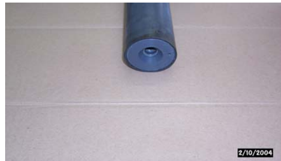
Bottom of electrode.