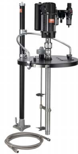
Piston Pump with Lid, & Lift for use with 55 gal drums