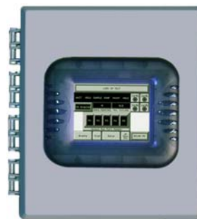
Auto voltage controller

The Auto Voltage Controller is designed to maintain the desired E-coat paint film thickness for a ware (regardless of the rack density) by making fine adjustments to the voltage. Even if you paint a wide variety of ware, there is plenty of built-in capacity to handle a variety of situations. The controller looks at the incoming current demand and then chooses the a final voltage for the proper E-coat film thickness. Originally developed for use with hoist or indexing E-coat paint systems, it can also be applied to monorail systems too.