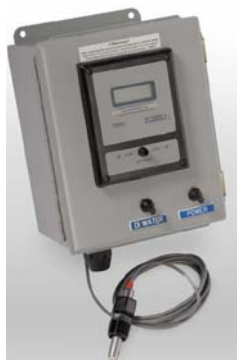
Controller and sensor assembly

UFS offers a Myron L digital conductivity controller pre-installed in a metal enclosure. For cathodic e-coat paint systems the electrolyte is called 'anolyte'. For anodic paint systems the fluid is called 'catholyte'. This controller will work with either and has a range of 0-20 milli-Siemens/cm ( same as 0 – 20,000 milli-Mho/cm). It has a set of dry contacts that close on rising conductivity so a DI water valve can be turned on to add water and dilute the conductivity to below its set point.